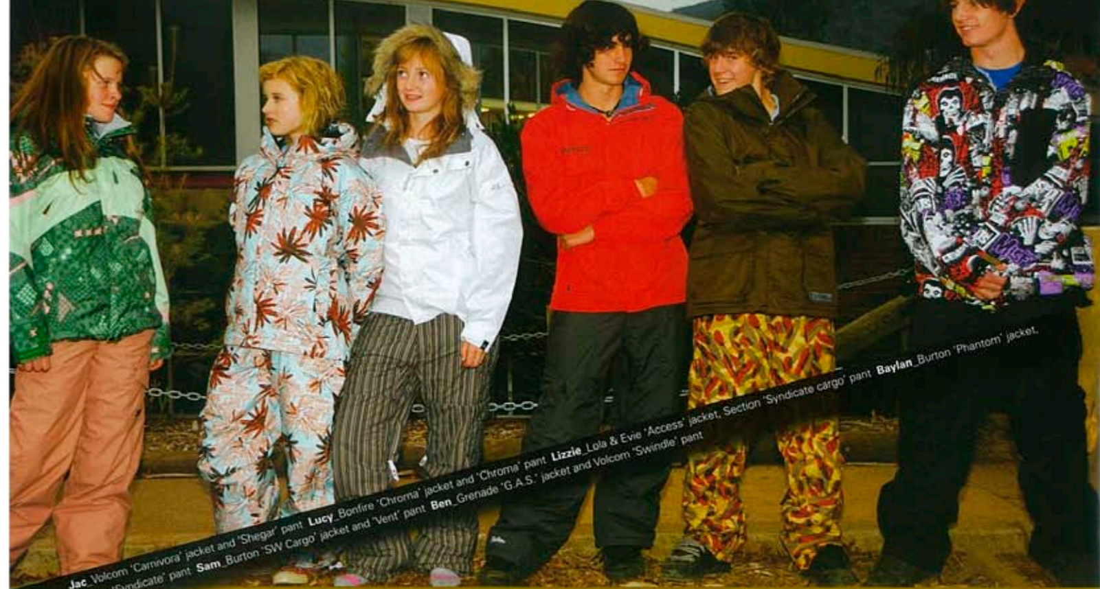
Jac_Volcom 'Carnivora' jacket and 'Shegar' pant Lucy_Bonfire 'Chroma' jacket and 'Chroma' pant Lizzie_Lola & Evie 'Access' jacket, Section 'Syndicate cargo' pant Baylan_Burton 'Phantom' jacket, Section 'Syndicate' pant Sam_Burton 'SW Cargo' jacket and 'Vent' pant Ben_Grenade 'G.A.S.' jacket and Volcom 'Swindle' pant